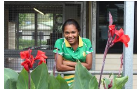
Junior Secondary Uniforms $25