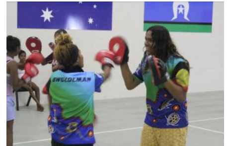
Senior students engaging in Recreation lessons as part of their efforts towards their Queensland Certificate of Education