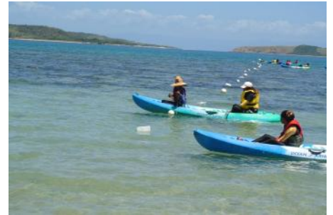
Students taking depth measurements along a transect at Pencil Bay

Fortunately the wind dropped out, the sun came out, the water cleared and we were blessed with a near perfect day. Pencil Bay was stunning. I was very impressed with the way the students conducted themselves and participated in the day to collect the relevant data. Students were using kayaks to take depth and temperature measurements and snorkeling to investigate what was living on the sea bed. A special thanks to Koipe and Kenny who assisted me in setting up the study site. Their efforts were outstanding and without their help the study would not have been the success it was.