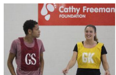
Teachers v Students Netball Challenge

While on the Orpheus Island Leadership Enhancement Camp students engaged in activities that were designed to develop their confidence, teamwork & communication skills